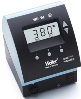
WD1M Power Unit (date code 04/08 or later)