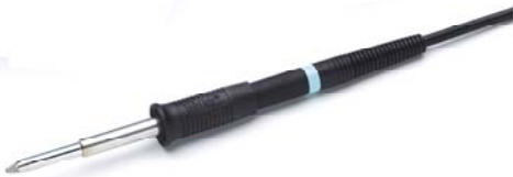
WP120 120 Watt Soldering Pencil

ESD Safe – RoHS Compliant – MIL-SPEC compliant