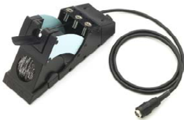
WDH10T Stop + Go Stand with Dry Tip Cleaning System